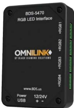
RGB LED Interface Control 4 RGB Strips