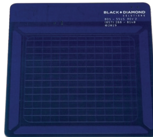
Gesture Panel Interface