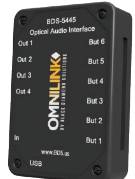
Optical Switcher 4 Outputs & 6 Buttons