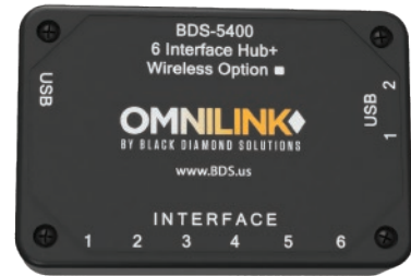
6 Interface Hub with Wireless option + 2 USB ports