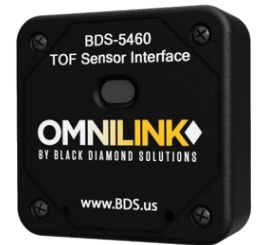
Distance or Motion Interfaces