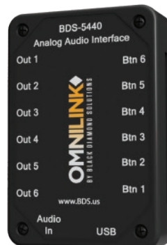
Analog Switcher 6 Outputs & 6 Buttons