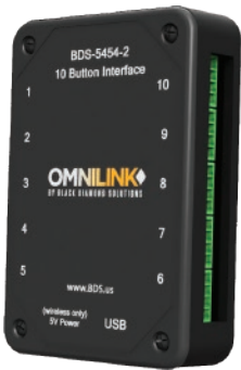
10 Button Interface PH4 or Phoenix connectors