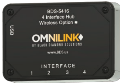
4 Interface Hub with Wireless option