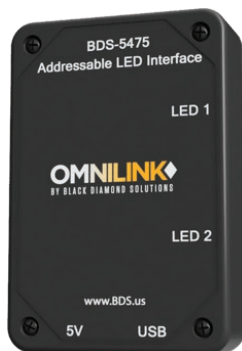
Addressable LED Interface Control 2 Addressable Strips